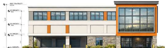
1 RIGHT - NORTH ELEVATION