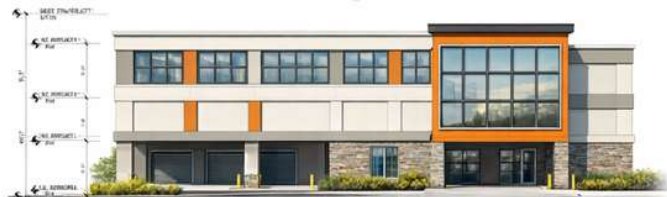
1 FRONT - EAST ELEVATION

VILLANO | ARCHITECTURE ARCHITECTS 1000 ROUTE 112 BAY SHORE, NY 11706 PH: 609.261.1111 WWW.VILLANOARCHITECTS.COM