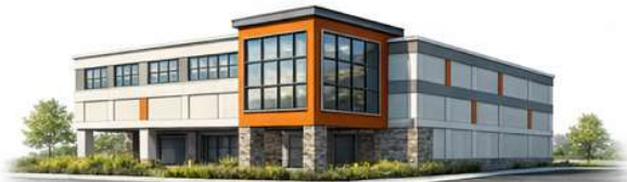
2 LEFT - SOUTH ELEVATION