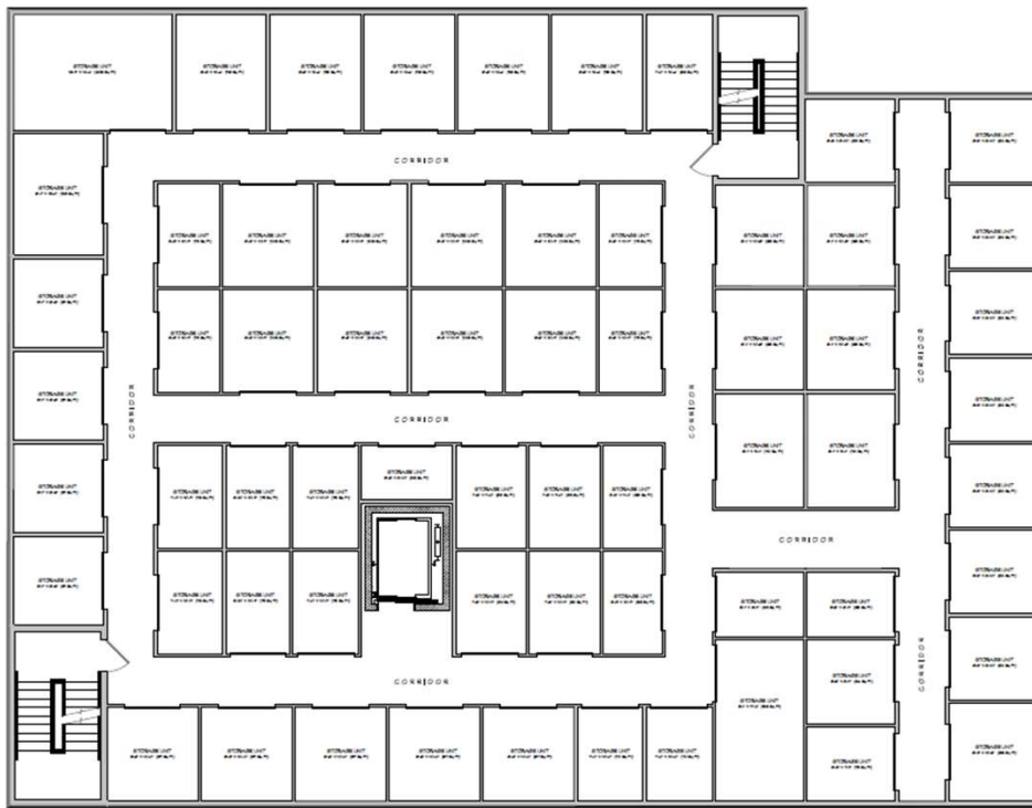
③ THIRD FLOOR PLAN (64 UNITS) DATE: 10/17/17

280 Spur Drive South Bay Shore NY , 11706