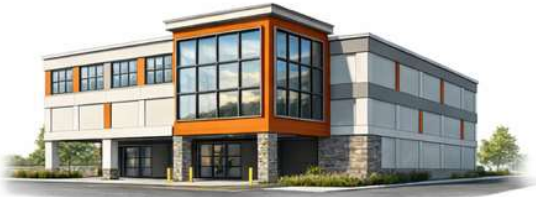
1 3D PERSPECTIVE 1