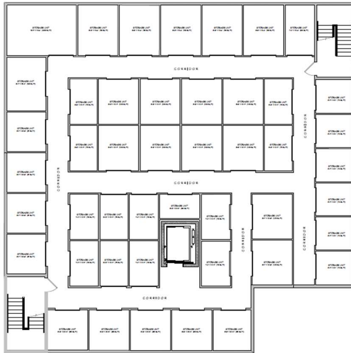
BSMT LEVEL PLAN (46 UNITS)

280 Spur Drive South Bay Shore NY , 11706