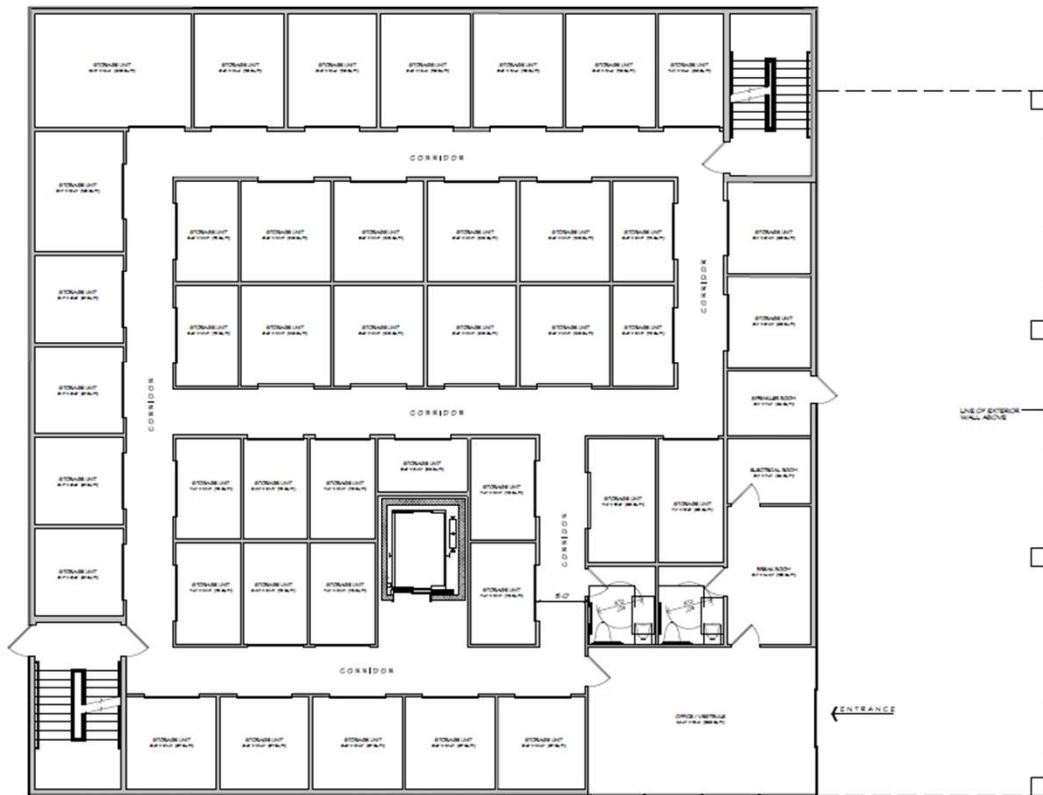
FIRST FLOOR PLAN (43 UNITS) Scale: 1/8" = 1'-0"

280 Spur Drive South Bay Shore NY , 11706